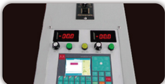
Image 1 - LCD Control Panel